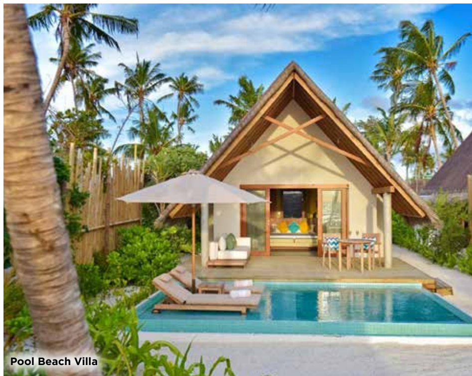
Pool Beach Villa