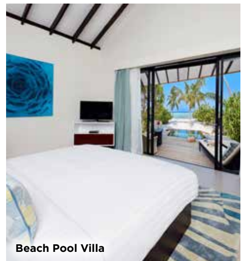
Beach Pool Villa

120 Standard Beach Villas, Beach Villas, Sunset Beach Villas, Beach Garden Pool Villas, Beach Pool Villas, Over Water Villas and Over Water Pool Villas.