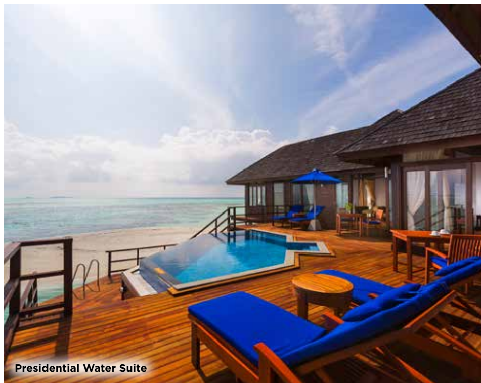
Presidential Water Suite