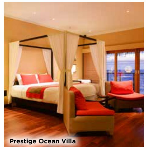
Prestige Ocean Villa

38 Garden Villas, 127 Beach Villas and 37 Prestige Ocean Villas.