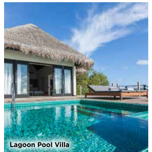
Lagoon Pool Villa

21 Beach Pool Villas, 8 two-bedroom Beach Pool Villas, 21 Ocean Pool Villas, 2 Lagoon Pool Villas and the Grand Konotta Villa.