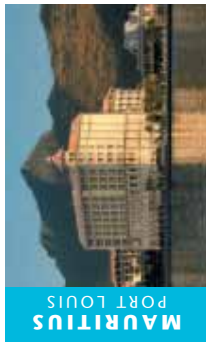
MAURITIUS PORT LOUIS

LOCATION: Stands opposite the National Palace set in mountainous countryside 7,800 feet above sea level and only 7 kilometers from Bole International Airport of Ethiopia with easy access to the city's commercial districts, the UNECA Headquarters, the United Nations Conference Center, the AU Headquarters and most non-governmental organizations. Only a short distance from many of Ethiopia's most renowned attractions. HOTEL FACILITIES: Bar, non-smoking facilities, restaurant, Business centre, internet access and conference facilities, with over 1,500 square meters of meeting space. Elegant guest rooms, exceptional recreational and meeting facilities and an extraordinary selection of fine restaurants. ACCOMMODATION: The hotel offers comfortable accommodation in 290 bedrooms. HOW TO GET THERE: Fly Kenya Airways via Nairobi.