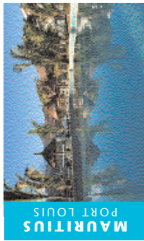
MAURITIUS PORT LOUIS

LOCATION: Situated on the Gaudan peninsula along the marina overlooking Port Louis harbour, 5 minutes from the financial and business centre, with direct access to Le Gaudan Complex (shops, restaurants, cinemas and casino). Within easy reach of the Pailles International Convention Centre & the Cyber City. HOTEL FACILITIES: Restaurants & bar, 6 conference & meeting rooms for up to 220 delegates, business centre, high speed internet connection, health centre with gym and steam room, swimming pool, hair & beauty salon, excursion to nearby beaches four times per week, sunset cruises twice a week, casino and 140 shops. ACCOMMODATION: 109 elegant and luxurious guest rooms and suites with harbour and marina views. All rooms have air conditioning, mini bar, satellite TV channels, 24hr room service, internet access & personal safe. HOW TO GET THERE: Fly SAA & Air Mauritius.