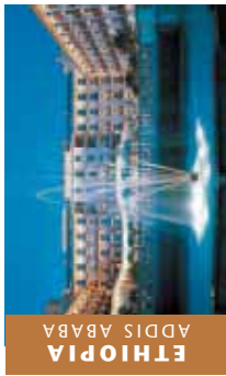
ETHIOPIA ADDIS ABABA

LOCATION: A modern 26 storey luxury hotel located in the city centre of Luanda, overlooking the bay. HOTEL FACILITIES: Business centre, 4 conference rooms, shops at the hotel, parking and leisure facilities near the hotel. ACCOMMODATION: 184 rooms with air-conditioning, IDD phone, mini bar, cable TV, safe, hairdryer. Superior rooms have a sea view, shower over bath, hairdryers, toiletries, direct dial telephone, minibar, remote-control colour television with satellite channels in French, English and Portuguese, computer data port, internet access. HOW TO GET THERE: Fly SAA.