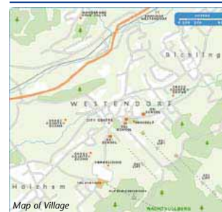
Map of Village

This is located 100m from the centre of town. It is newly renovated and all rooms have TV and en-suite facilities. The rooms are very comfortable with good views of the mountains.