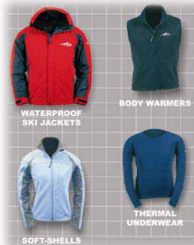
WATERPROOF SKI JACKETS

SUN PROTECTION: Most people are aware of the dangers of too much exposure to the sun. However the sun's rays are intensified by the high altitude and reflection from the snow. Use a high factor sun cream for your face, ears and neck. Don't forget to apply lip balm to your lips regularly throughout the day.