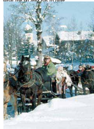
Enjoy horse-drawn carriage rides in Westendorf

For intermediate and advanced skiers, Thompsons representatives will show you what the ski area has to offer