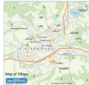
Map of Village

This charming Pension (bed & breakfast) offers a cosy family atmosphere and is situated close to the Horn Bahn and cable car. It is also just a few minutes walk from the town centre. The accommodation is in comfortable, Alpine style rooms with showers and private facilities.